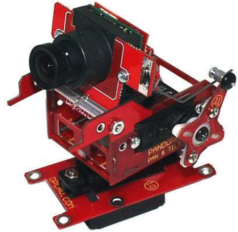
Figure 1, Top Mount

Note: If you look closely at Figure 3 you may notice that the A/V cable has a piece of solid wire looped around it and screwed to the nearby stand-off. This is one way to strain relief the cable, but you can choose any method that suits your application.