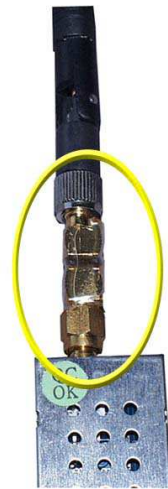
Figure 2, TXF-900

Note: Do not operate the TX905-PRO without an antenna and only use antennas that are designed for 900MHz operation. Failure to follow this is harmful to the transmitter's circuitry and may cause permanent failure.