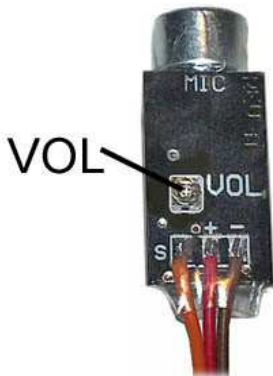
Figure 4, Volume