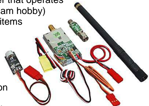
Figure 1, TX905-PRO

This transmitter differs from other 900MHz models because it includes EMI/RFI filtering technology to help reduce frustrating RF noise problems. The filtering includes a Ferrite type common-mode choke, LC-filter components on a custom circuit board, and a novel low pass filter that is installed on the antenna connector. These filters work together to help minimize conducted and radiated EMI/RFI noise.