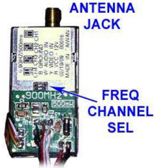
Figure 5, Frequency Switches

Note: Due to FCC regulations, all TX905-PRO transmitters that are delivered to USA destinations will be permanently set to CH-1 (910MHz). Only models shipped outside the USA will have the channel select switches shown in Figure 5.