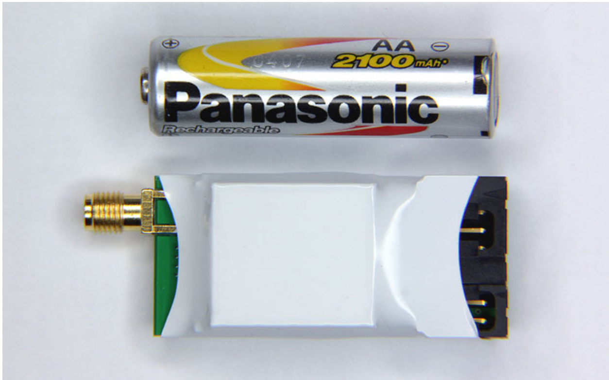
Figure 1. The diminutive size, measuring just 50x23x15mm, that's 40% smaller than its predecessor.